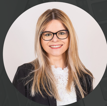
MARINE BONDUELLE ESPAS-ESTICE, France